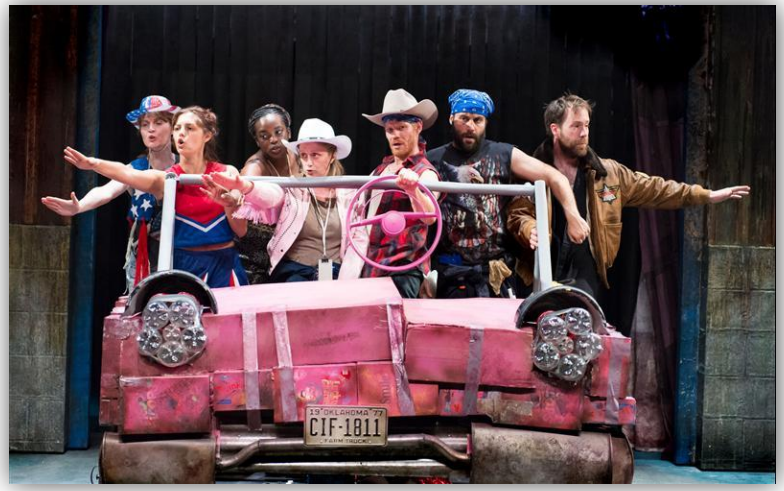
Figure 1. The post-electric world of Mr Burns

As a national portfolio organisation supported by public funding from Arts Council England, we are committed to monitoring the impact our productions and our employees have on the environment. We produce at least six plays a year in our 325-seat theatre, transfers to the West End and on tour across the UK and beyond, and we work extensively with our local community and young people.